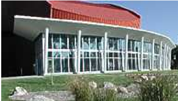
ADAMS STATE COLLEGE